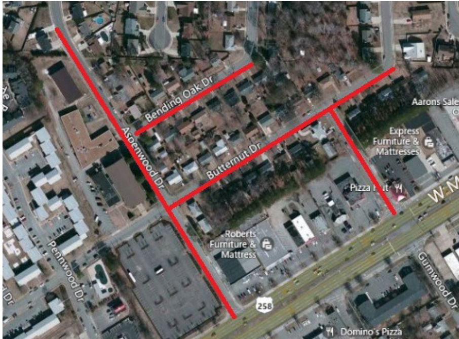
Project map, affected streets highlighted in red (above)