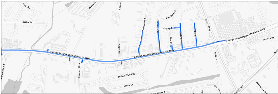
York County project map, affected streets highlighted in blue

The work in your neighborhood is part of the Steps to Advance Virginia's Energy (SAVE) program, our company's modernization initiative aimed at renewing our existing natural gas infrastructure. During this project, we will replace aging, older pipes with new pipes that are more durable, reduce methane emissions and are less expensive to maintain.